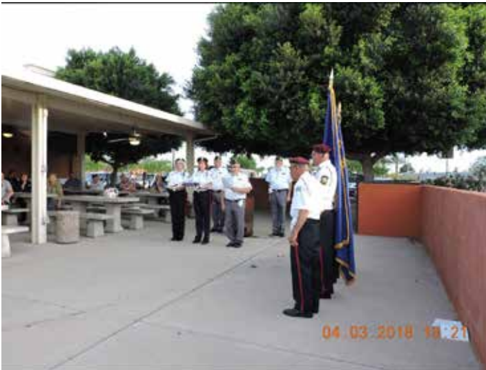
Color guards getting ready for Flag retirement ceremony. Both the ladies and the men's color guard participated.