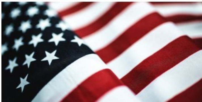
THE UNITED STATES FLAG