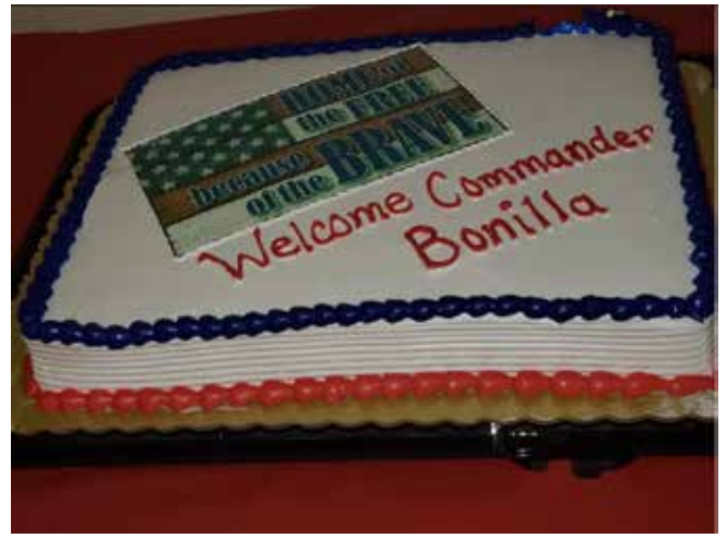
A very nicely decorated cake for Commander Bonilla.