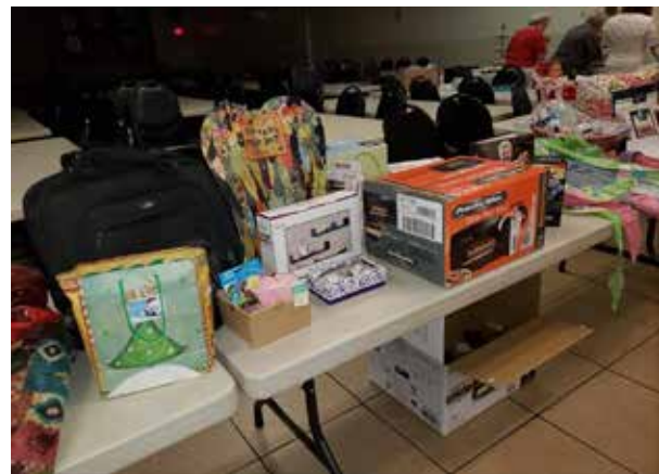
Three pictures from the 8 and 40 Salad Luncheon.