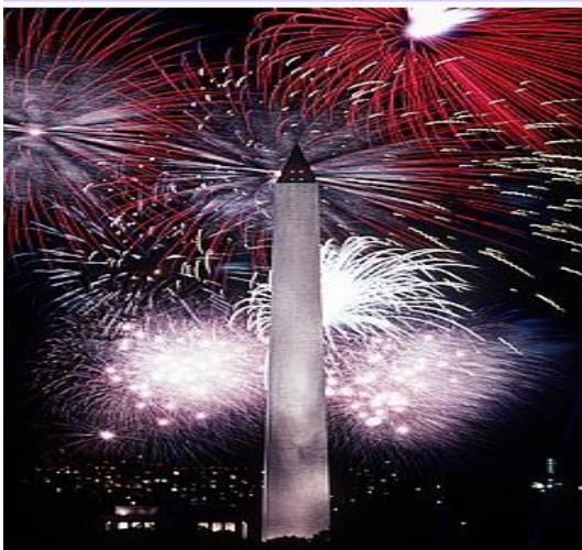
Displays of fireworks, such as these over the Washington Monument in 1986, take place across the United States on Independence Day.