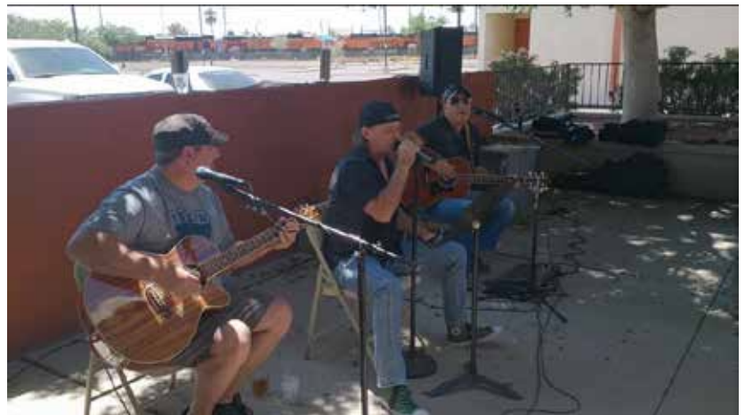
Top picture is of the Whiskey Bent Band playing for SAL's Boy's State Fund-raiser on Sat the 28th.