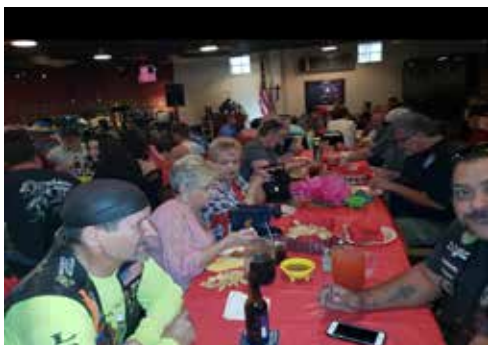
Cino De Mayo dinner guests